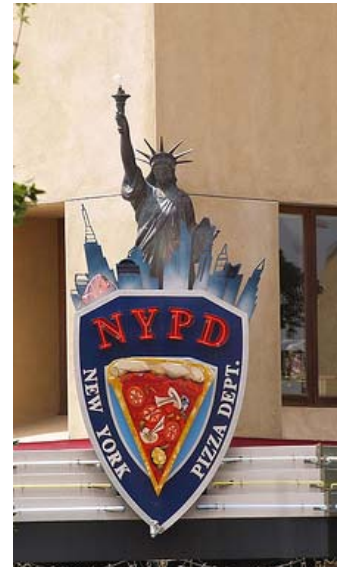
Could this be an approved sign type in Downtown's future?

This updating of our Downtown Design Guidelines and Sign Ordinance presents an opportunity for all of us to have a say in how our neighborhood will look, what we will allow and what we will not. Do you want banners draped all over buildings? Should such advertising be limited to the business in the building, or other Downtown businesses, or should it be open as billboards on the highway? Is the information contained on sidewalk sandwich boards worth the clutter and obstacles they create? May old buildings receive contemporary alterations? Do historic details have to be retained regardless of cost? These